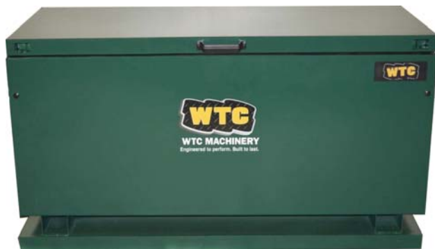
Travel Box MPP150-SB

To protect your investment and keep everything together in one convenient spot WTC offers either a custom storage/travel box or a travel skid with optional cover for safe and secure storage and transportation of your MPP150 press, pump and tooling.