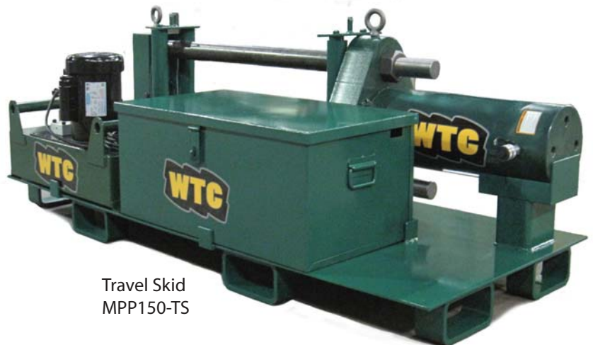
Travel Skid MPP150-TS